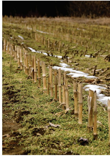
Home-grown corn helps support Great Brook Farm's dairy herd.

PO Box 337 Keene, New Hampshire 03431 (603) 357-0600 www.MonadnockConservancy.org