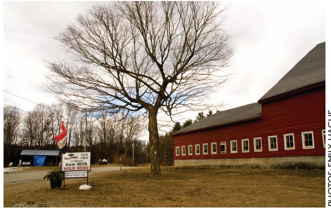
The farm's Milkhouse store.